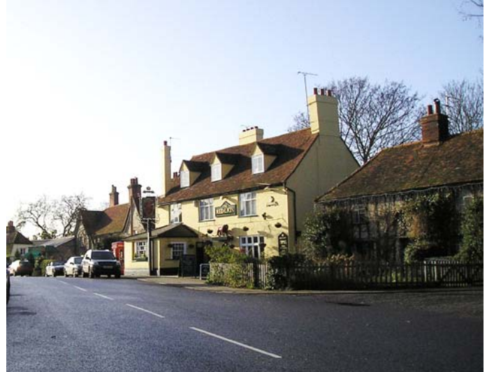
The busy village store and Post Office and one of the four public houses.

Known by so many people as the birthplace of the artist John Constable, it is also famous for its beautiful church of St. Mary the Virgin with its bell cage beside it. The church was built mostly in the fifteenth and early sixteenth centuries and was the benefit of East Bergholt's celebrated cloth industry wealth. It was built in a prominent place at the village's highest point, just a stone's throw away from Old Hall (once a monastery,