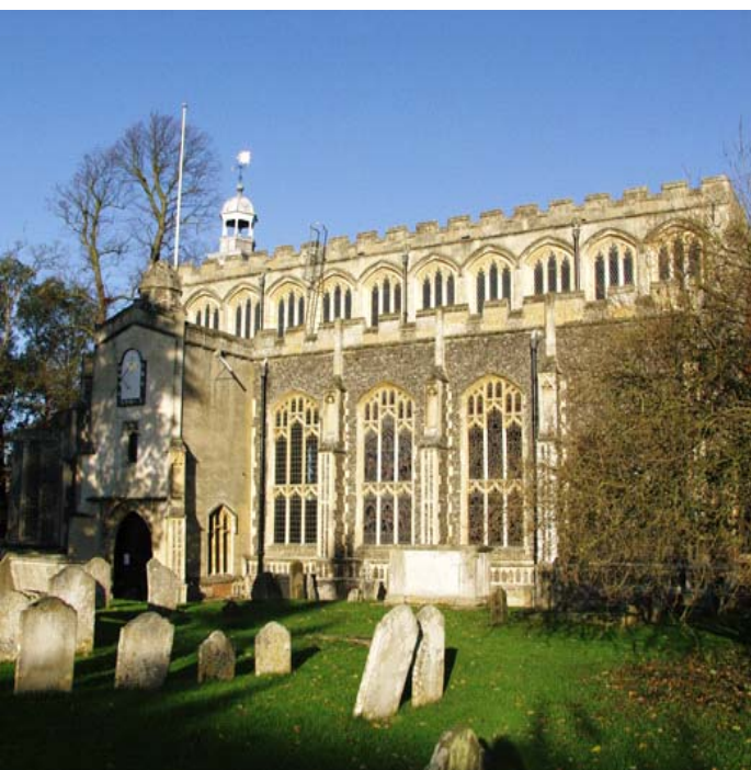
St Mary the Virgin Church, East Bergholt

East Bergholt & Constable Country website: www.eastbergholt-bells.org.uk