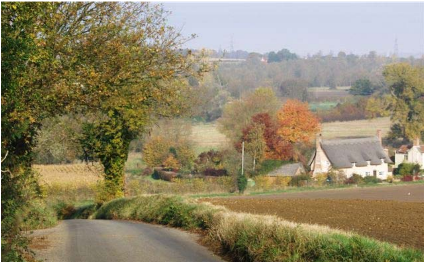
View from Higham Hill