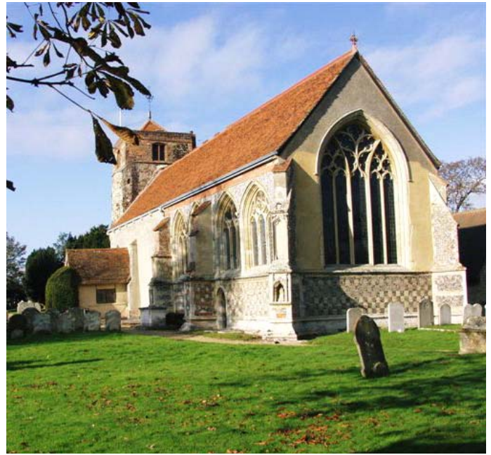
St. Mary's Church

Nearby stands Lawford Hall, built in the 1580s in timber-frame on a H-shaped plan, but two-hundred years later, refronted in brick at a time when, in common with many other timber houses in the area, and in particular, Dedham, Georgian facades were added. A most elegant building.